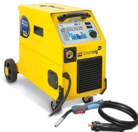
Earth Clamp and 2m EURO torch included.

Constant running fan protects unit against overheating.