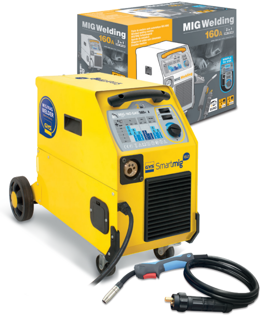
Earth Clamp and 2m EURO torch included.

Constant running fan protects unit against overheating.