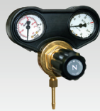
Regulator 30L/min 041622 041219 041646