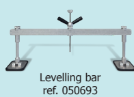
Levelling bar ref. 050693