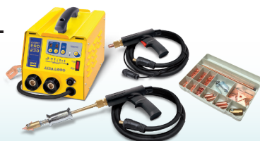
SPEEDLINER PRO 230 - ref. 036017 SPEEDLINER PRO 400 - ref. 036024