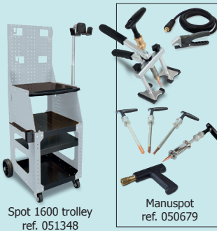
Spot 1600 trolley ref. 051348