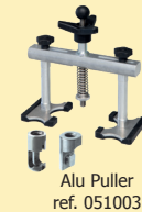
Alu Puller ref. 051003