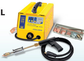
SPEEDLINER 39.02 - ref. 035010 SPEEDLINER 39.04 - ref. 035027