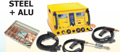
SPEEDLINER Combi 230 E PRO - ref. 036062