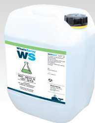
Cooling liquid 10 L ref. 052246