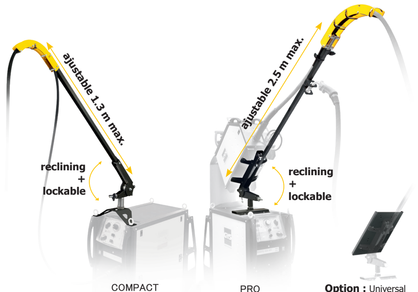
Option : Universal support for mig lift pro: can use any wire feeder ref.046436