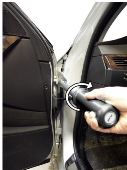
② Tighten by simply turning the handle