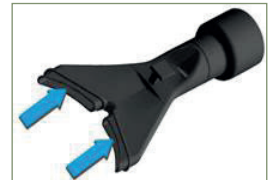
Two suction outlets

Designed to limit dust, the sanding pad is made up of numerous holes to improve dust extraction. Increased volume of dust extracted compared to a traditional sander. The sander is equipped with two suction outlets to redirect the dust towards the extraction duct.