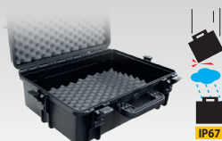
Carry case 060432