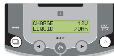
Intuitive interface available in 22 languages