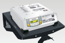
Wall shelf 055513