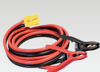
8 m - 16 mm 2 056572