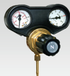
Regulator 30L/min 041622 041219 041646