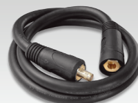
Polarity reversal cable 033689