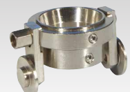
Trolley for Torch TPT 40 040199