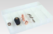
Consumables box for Torch TPT 40 45 A - 039957