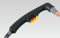
Torch MT-70 manual 70 A (50%) 6 m - 037502 12 m - 037519